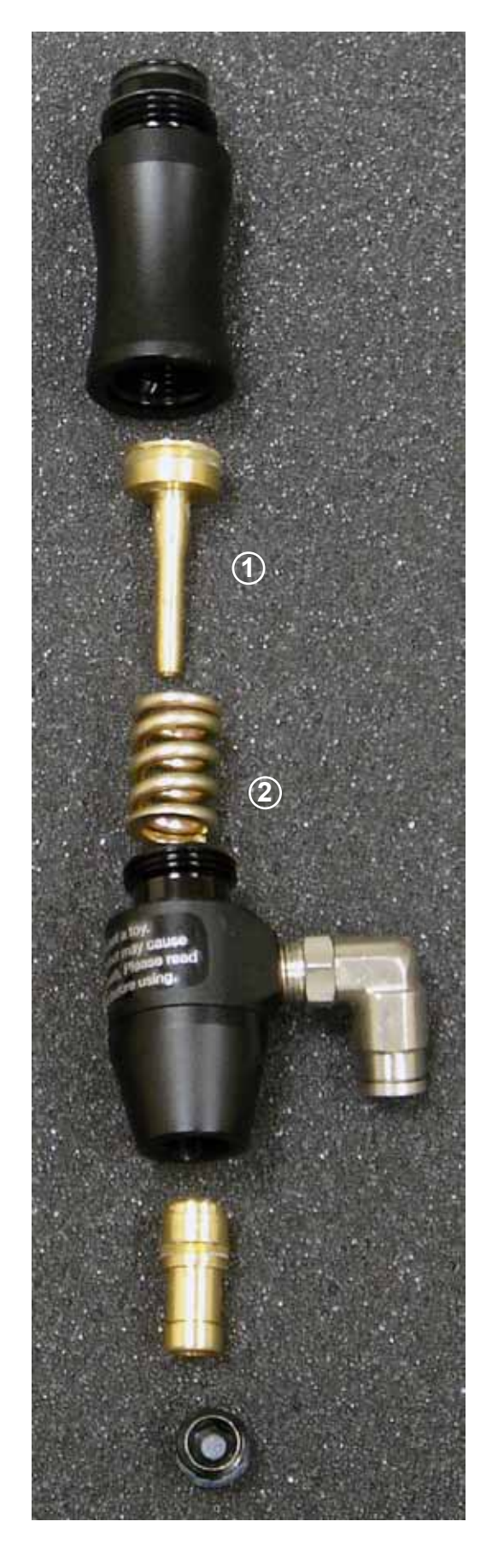
POSSIBLE CAUSE: Poorly maintained Inline Regulator.

SOLUTION: Clean and rebuild Inline Regulator. Replace Inline Regulator Piston & Seat Seal carrier or main spring if necessary.